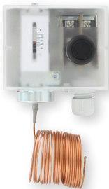
Показана опция ручной переустановки